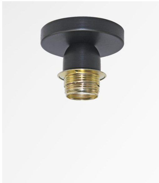
KENTIKA MINI in brushed bronze