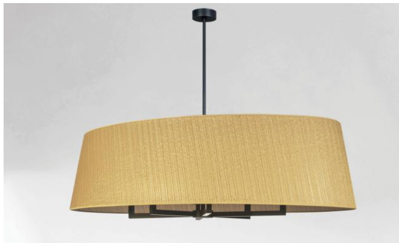
TOURAH 6 OVALE in brushed bronze with oval lampshade L130cm in Plissé Or (fabric from category 4)