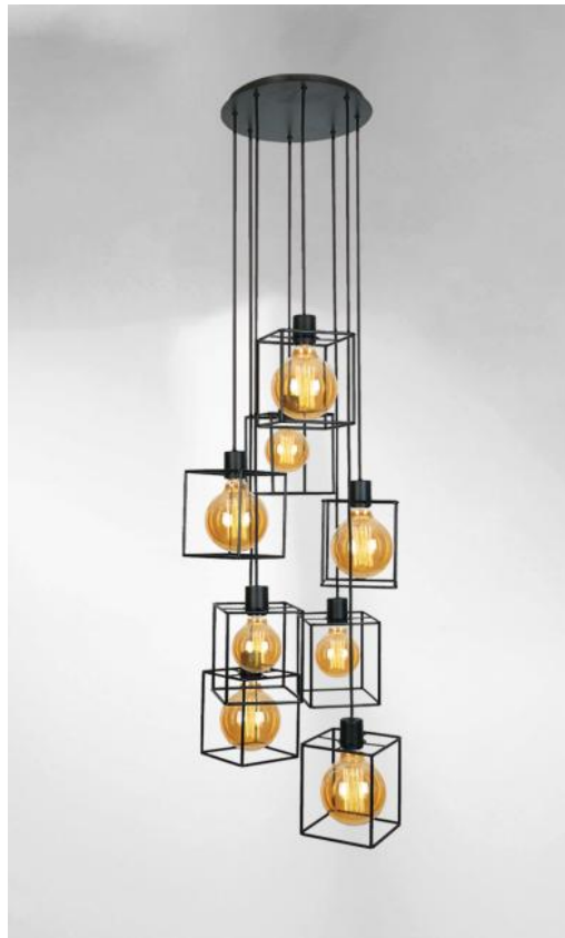
KERMA 8 o30 in brushed bronze with structures in black epoxy