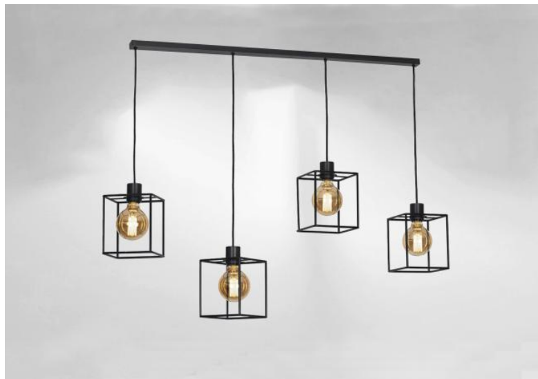
KERMA L 4 in brushed bronze with structures in black epoxy