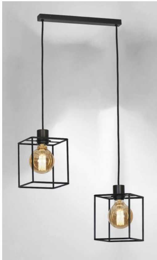
KERMA L 2 in brushed bronze with structures in black epoxy