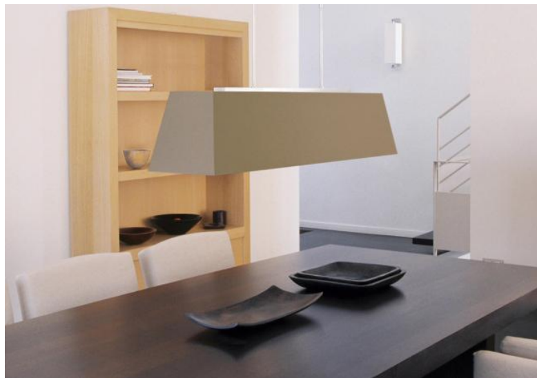
HENOUTMIRE 3 in brushed chrome with lampshade LARGE in Seta taupe (fabric from category 3)