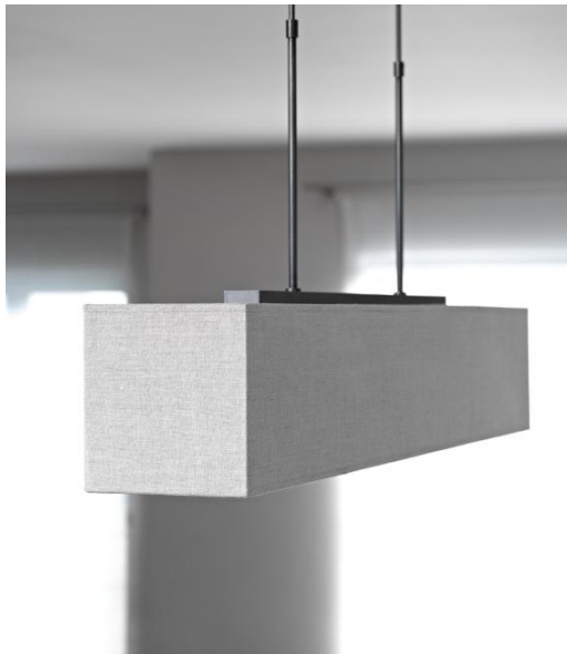
HENOUTMIRE 3 in brushed bronze with lampshade MEDIUM in Lin Pompéi (fabric from category 2)