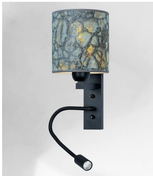
KARY in structured black with lampshade Tilia Starry Blue (fabric cat.5)