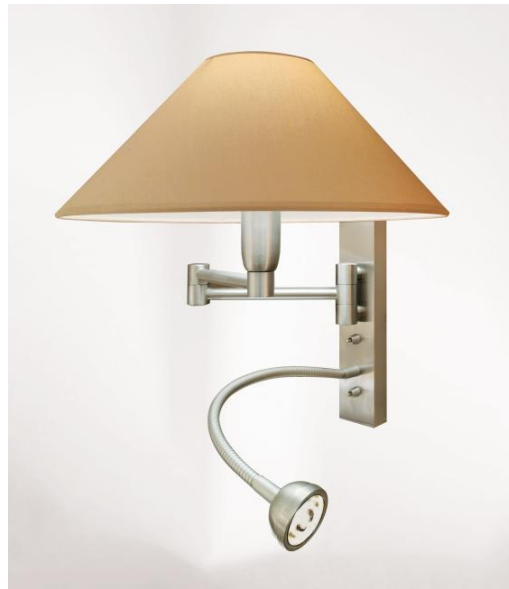
AHMES in brushed nickel with lampshade in Coton Sahara (fabric from category 1)