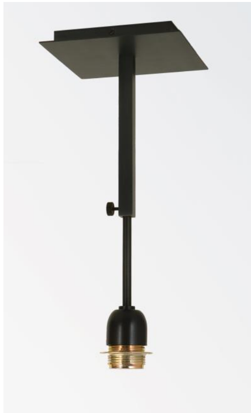
MEHA in brushed bronze without lampshade