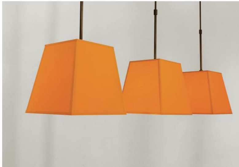
ARSINOE in brushed bronze with lampshades in Coton Safran (fabric from category 1)