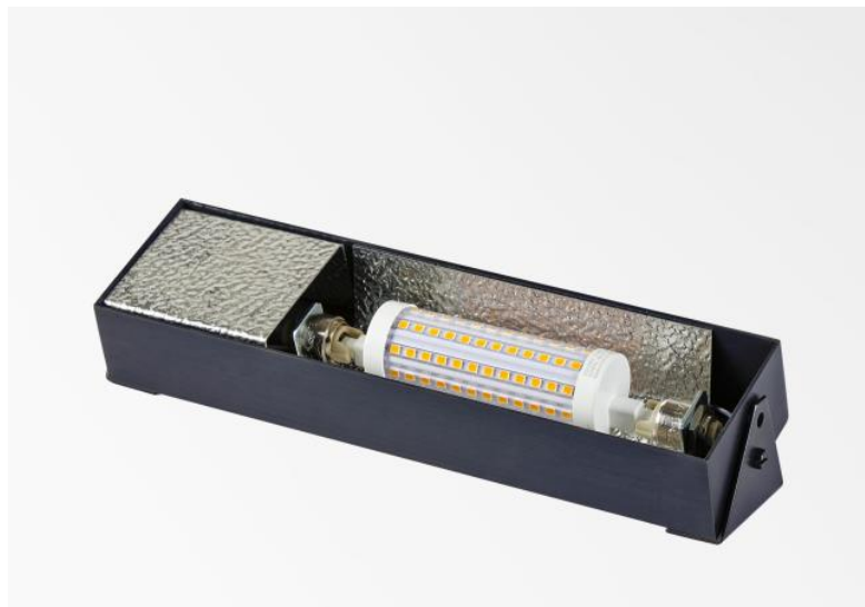
UP 25 in brushed bronze. Metal finish code: 29