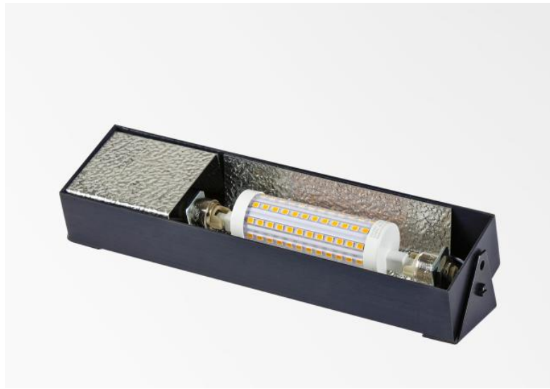
UP 25 in brushed bronze. Metal finish code: 29