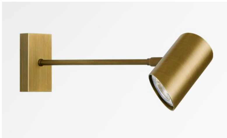
PALMA in light bronze. Metal finish code: 28