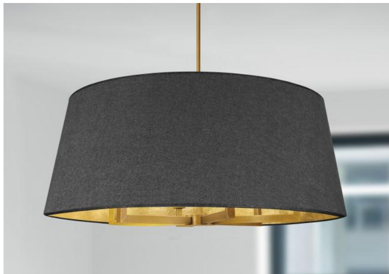
TOURAH 6 LARGE in light bronze and lampshade Ø90cm in Stone Diorite (fabric from category 4) + Gold Leaf inside