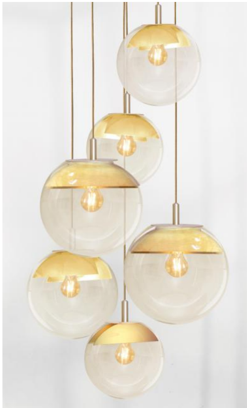
LUNA 6 ø38 in brushed brass (code 25) with transparent glasses (code 80)