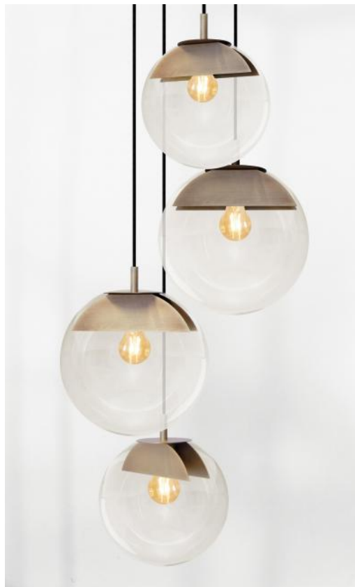
LUNA 4 o26 in light bronze (code 28) with transparent glasses (code 80)