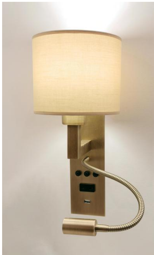
Wall lamp for bedboard in light bronze with cilindrical lampshade in Coton Pirée (fabric from category 1)