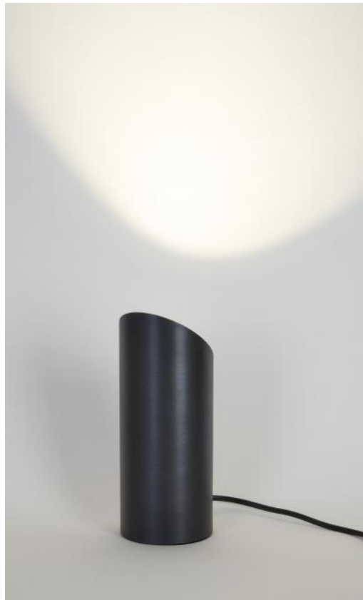
UP 90 in brushed bronze