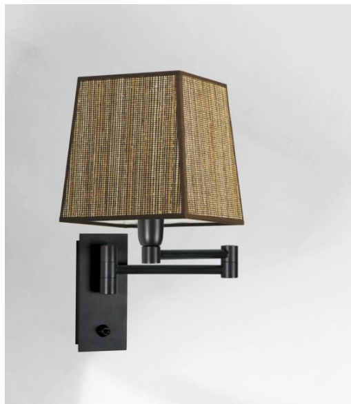
AHMOSIS +SW in brushed bronze with lampshade in Jacinthe Miel Noir (material from category 5)