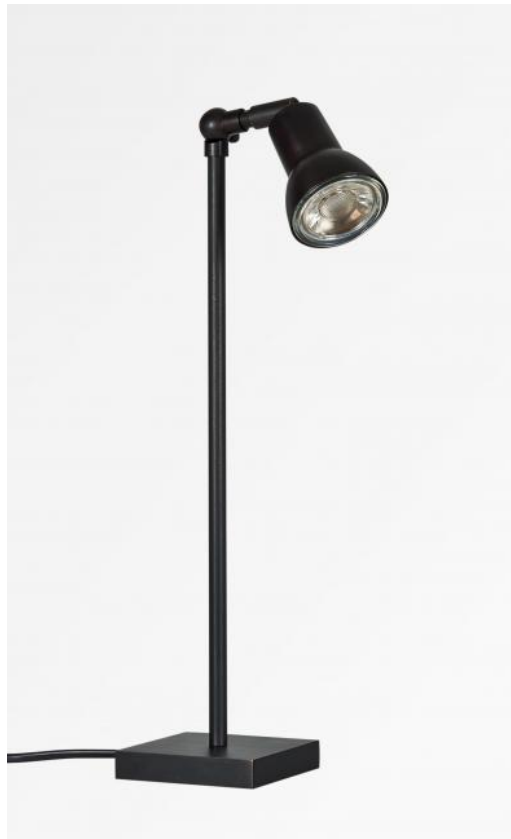
VENATOR 1 in brushed bronze