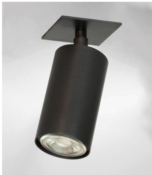
DEIMOS P1 # in brushed bronze (code 29)