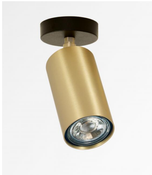
DEIMOS S1 o in structured black and brushed brass (code 45)