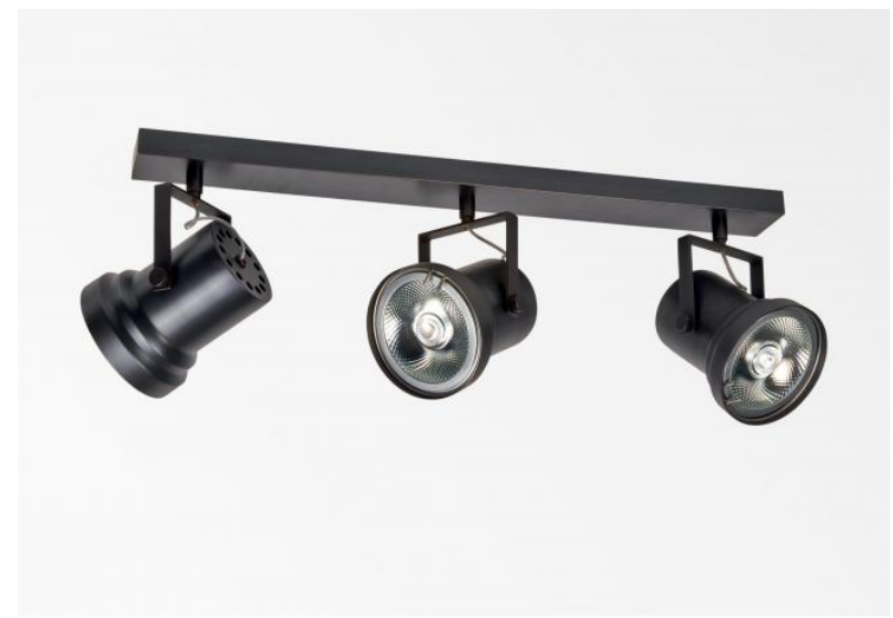
ATHENA 3 in brushed bronze