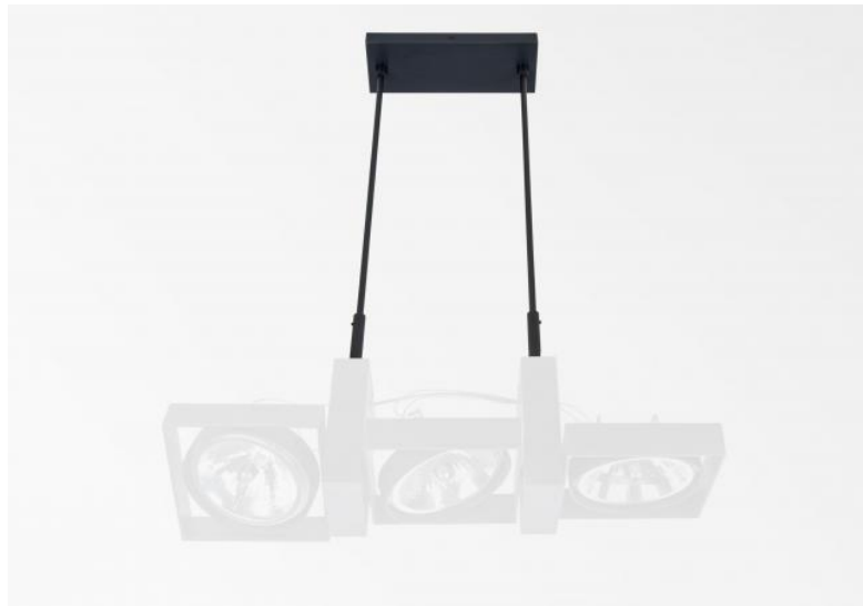
SARGAS 3 mounted on a SARGAS 3 SUSPENSION