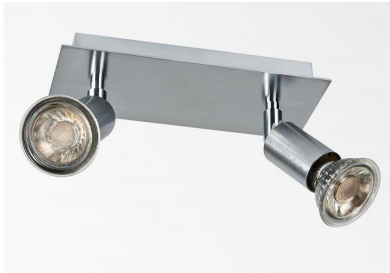
MERCURE 2 in brushed chrome