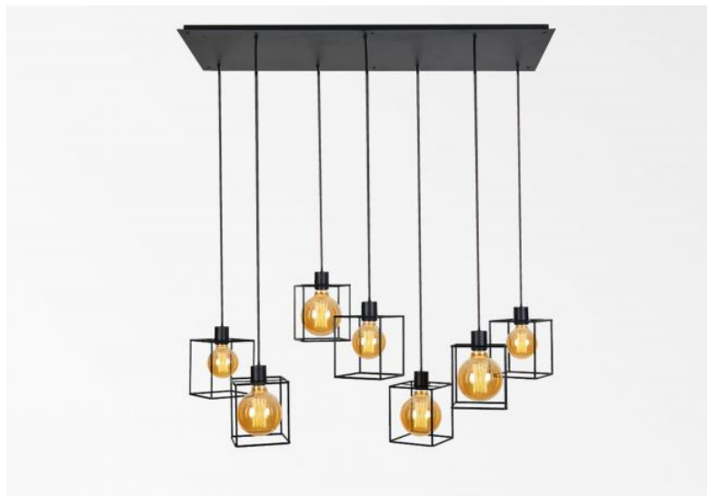
KERMA 7 # in brushed bronze with structures in black epoxy