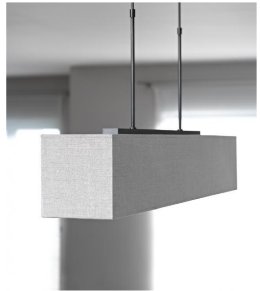
HENOUTMIRE 3 in brushed bronze with lampshade MEDIUM in Lin Pompéi (fabric from category 2)