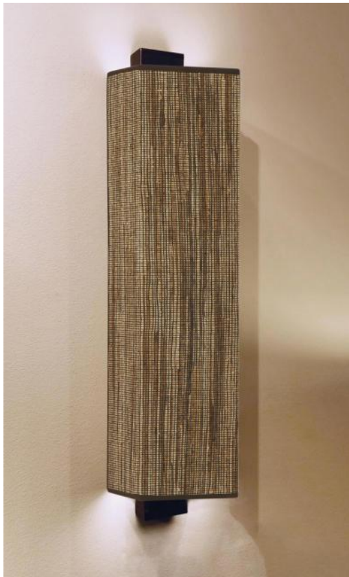
CHABAKA 2 in brushed bronze with lampshade Jacinthe Miel Noir (material from category 5)