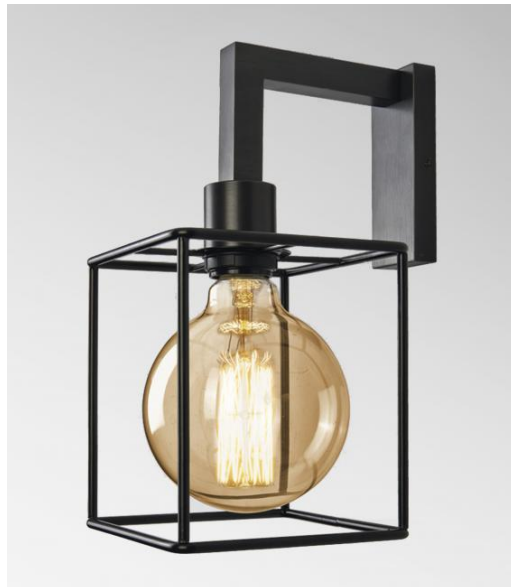
MESSENGER in brushed bronze with a KERMA structure in black epoxy and a decorative gold bulb Ø125mm